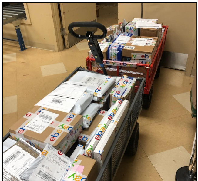
eBay shippers pack and ship 30-40 books per day.

Contact Michelle Vineyard at 865-696-8692 or michellevineyard@gmail.com